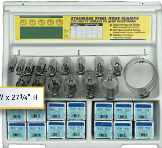
24 1/4" W x 27 1/4" H